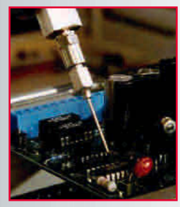
SELECTIVE CONFORMAL COATING