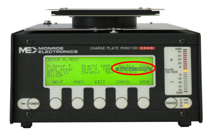
Figure 6. Selecting the balance duration to be infinite.