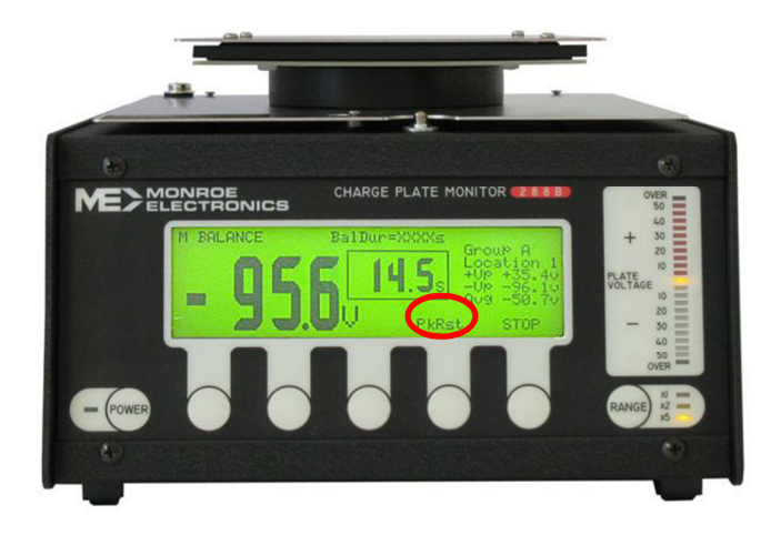
Figure 5. The CPM in the balance mode optimized for pulsed DC ionizer measurements.

Set the Balance Duration to XXXXs which disables the balance time. As can be seen in the figure and then the unit will only reset when the PkRst (peak reset) menu button is pushed. Operation becomes simple. Enter the balance mode, wait of a few cycles of the ionizer as viewed on the CPM screen and then push PkRst. The balance readings will be stable and make good sense as compared with conventional CPMs which do not have this feature.